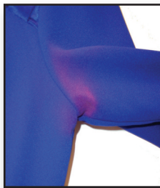
The underarm area of this blouse was discolored by perspiration.

Damage due to consumer use or storage is often not apparent until after cleaning. Many staining substances are invisible when they dry, but they oxidize, darken, and therefore become visible when exposed to heat in cleaning and pressing. Likewise, several staining substances, such as alcoholic beverages, perfumes, or household cleaning products, contain chemicals that contribute to color loss.